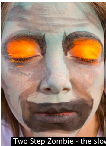
Two Step Zombie - the slower, shambling type zombie