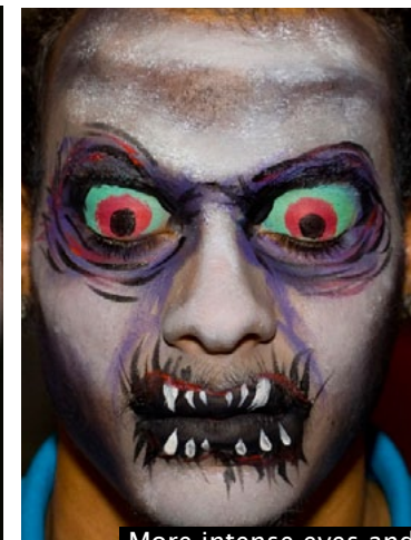
More intense eyes and some gore for the modern, faster type of zombie