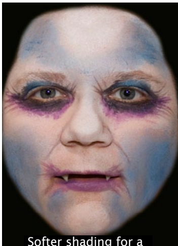
Softer shading for a more Theatrical style