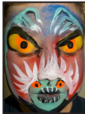
BECOMING A MONSTER