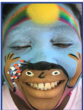
BEST DAY EVER