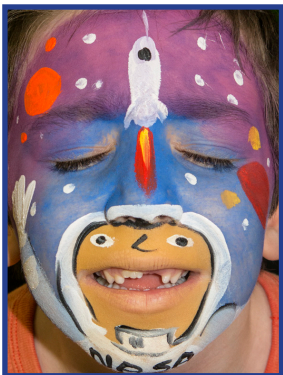
ASTRONAUT IN SPACE

Here are some examples of Amazing Face Stories I have painted: