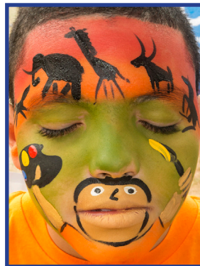
ARTIST PAINTING ANIMALS