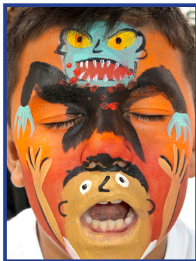
CHASED BY MONSTER