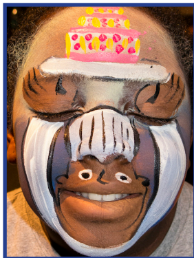
WORLD FAMOUS CHEF